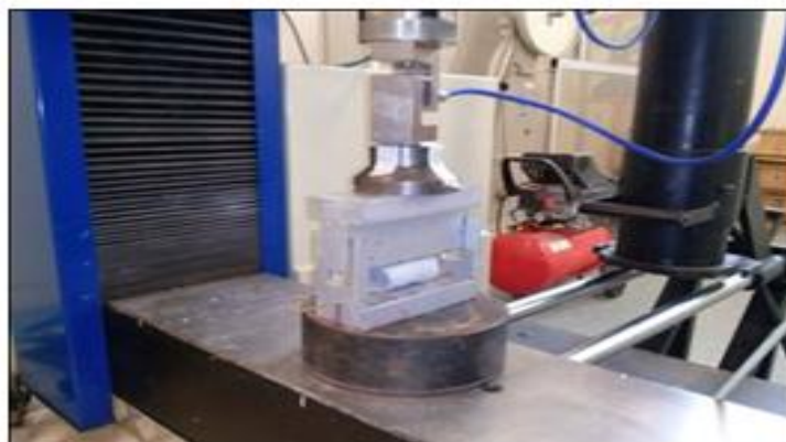
Figure 3: Splitting tensile test.

The tensile strength was measured by splitting tensile test (Brazilian tensile test). Four specimens were used at each testing date. Tests were performed at a constant displacement control rate of 0.5 mm/min (Fig. 3).