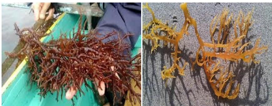
Figure 5.2. Seaweed Eucheuma cottonii type

In general, seaweed farmers in Southeast Sulawesi region cultivate seaweed Eucheuma Cottonii . Eucheuma cottonii is one species of red seaweed and changed its name to Kappaphycus alvarezii as carrageenan produced, including kappa-carrageenan fractions (Fausayana, 2014). Aslan (1998) and Anggadireja et al (2009) suggested that the characteristics of Eucheuma sp. , Ie cylindrical thallus; slippery surface; Cartilageneus (have cartilage / young) and bright green, olive green, and red chocolate. The thallus branches are pointed or blunt, overgrown with nodules (bumps) and soft / blunt spines to protect the gametangia.