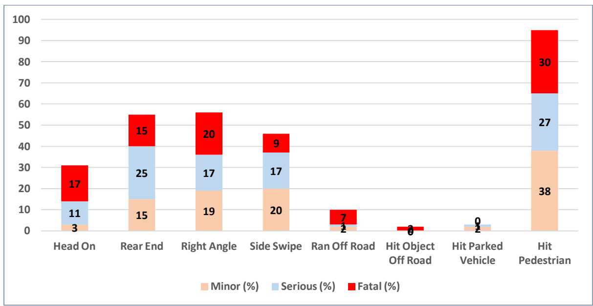
Figure 1: Road traffic injury severity among motorcyclists by collision type.

Among the motorcycle accident victims, 47% of the casualty injury was a result of inattentiveness on the part of the motorcyclist while 20% was a result of motorcyclists being too fast and 22% was through no fault of theirs as shown in table 1. Motorcyclists' inattentiveness and riding too fast resulted in a fatality of 39% and 30% respectively. Also, no apparent fault was associated with 18% of all motorcycle fatalities. With regard to serious injuries, 45% and 19% were as a result of riders' inattentiveness and riding too fast respectively.