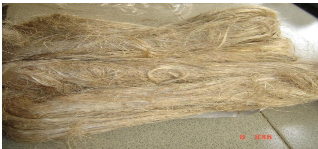
Figure 3: A photograph of banana fiber

A cross sectional area of strand of the fibers obtained (Fig 2) shows a white line which revealed the cellulose in the fiber while the dark spots and lines indicated points of microbial attack of the cellulose [10]. Figure 3 shows fibers that have been completely retted from banana trunk.