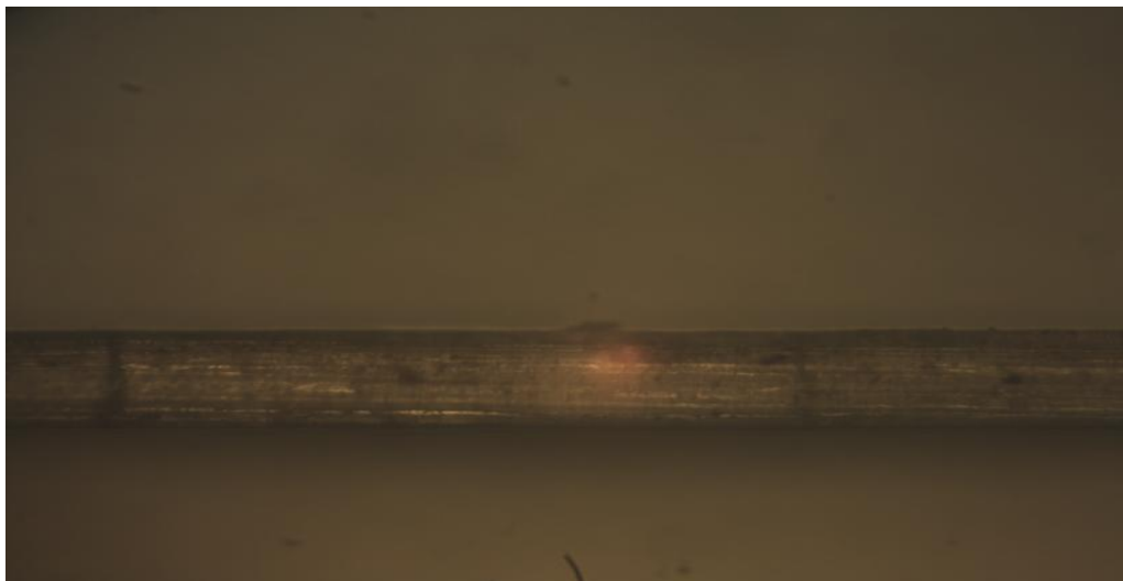
Figure 2: cross-sectional area retted banana fiber (x400) using Nikon Eclipse ME 600 microscope