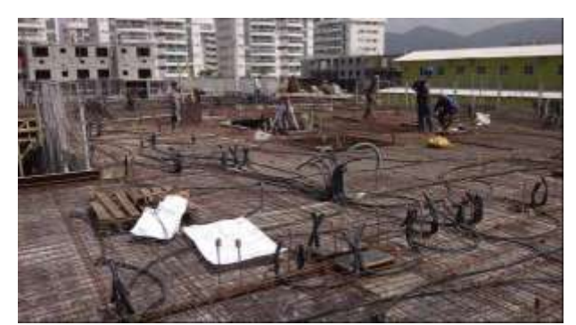
Figure 3.Image of the execution of the negative and positive frames as well as the electrical installation in the slab.

Before levelling of the form to fit the correct ceiling height estimated in the design, a variety of other installations are implemented: electrical installations (Fig. 3), including lightning rods that should not be concreted inside the block, hydraulic installations, air conditioning drains and boxes for future passage of slabs, gas installations embedded in the slab, and execution of the frame, with the positive and negative mesh of the slab hardware. After levelling, spacers are placed between the iron mesh and the floor so that the frame does not touch the wood and is not concreted incorrectly [30, 31].