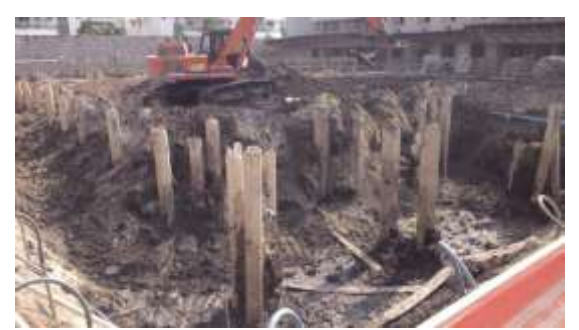
Figure 1. Foundation using precast concrete stakes.

Other types of foundations may also be used depending on the soil where the building will be built. Indirect foundations may be used, such as deep foundations with precast reinforced concrete perforated to 15 to 20 m deep with crowns of stakes and crown blocks interconnected by straps [26]. Fig. 1 illustrates the type of foundation used in a structural masonry project.