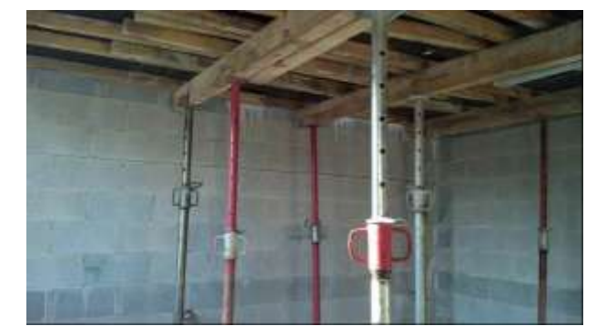
Figure 2. Image of the forms used in a structural masonry construction.

Forms can be considered as the set of components whose main functions are to mould, contain, and sustain fresh concrete until it has sufficient strength to support itself and to provide the required texture for the concrete surface [29]. Fig. 2 shows the forms used in civil construction.