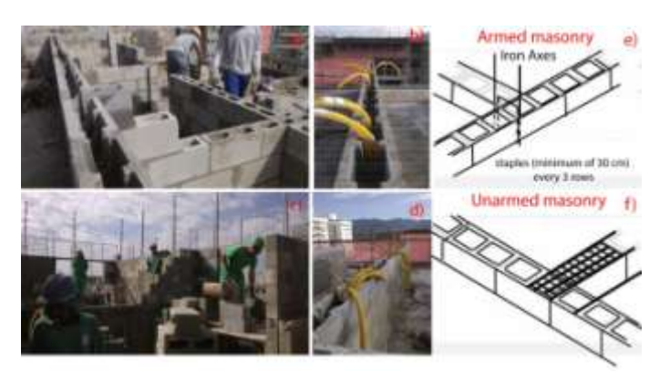
Figure 5. a) First elevation of masonry, b) Sixth row gutter picture where an iron is placed horizontally to be grouted, c) Second elevation of masonry d) Sixth row gutter picture showing the electrical guide and gutter frame, ready to be grouted, e) armed masonry illustration and f) unarmed masonry illustration, both showing in detail the connecting armature of the outer walls.

The same process is repeated when the second masonry elevation is executed (Fig. 5d). The only thing that differs from the first elevation is the attention to the window spans that appear in that elevation, and these must conform to the pagination design of the walls. It is also important to pay attention to the staples or wire meshes placed in the armed and unarmed masonry, Figs. 5e and 5f, respectively.