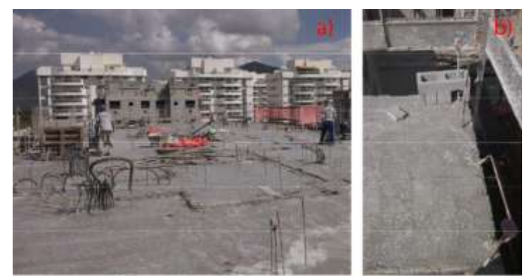
Figure 4. a) Image of grout points and b) iron axes placed before concreting to indicate the marking and location of the blocks.

but before concreting, the grout points (Fig. 4a) need to be given careful attention. It is necessary that these points follow exactly what was determined in the project, because each grout point plays the role of a pillar in the structure, so each point needs to be placed in the same position, slab after slab, with no deviation. Furthermore, attention should be paid to the placement of the iron axes (Fig. 4b) that will be pulled after the concreting to indicate where the marking and location of the blocks will be made. Finally, tubes must be put in the peripheries so that they can be removed after the concreting and placed in the same location for the peripheral protection of the perimeter masonry.