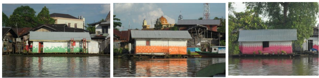
Figure 1. Lanting house frontage from the river

Lanting houses can be accessed from the river and from the land. Because of the rapid development of roadways in the city of Banjarmasin, the lanting house then more accessible by road. To go to the lanting house, using a wooden footbridge, the path is composed of boards with pole construction. Lanting house frontage from the river and the land is showed in figures 1 and 2.