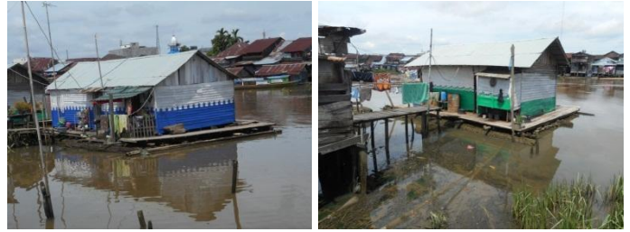
Figure 2 . Lanting house frontage from the land