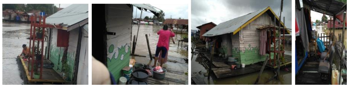
Figure 5. Domestic activities on the terrace of lanting house Source: Personal documentation, 2017

Differences in the use of space can be known from the settings formed by semi-fixed and non fixed elements. Domestic activities that take place on the terrace, forming various settings according to activities and supporting elements, namely diswashing setting, clothes washing setting, bathing settings, clothes drying setting and relaxing setting. When dishwashing and clothes washing, equipped with semi-fixed element in the form of buckets/water basins. Similarly with bathing, will be equipped with semi-fixed element in the form of scoops and soap containers. The lounge area is equipped with benches. The dishwashing activity is closed to the kitchen, while clothes washing and bathing, being free along the terrace where the inhabitants desire. The settings formed on the terrace are flexible in accordance with the activities undertaken and the existing semi-fixed elements.