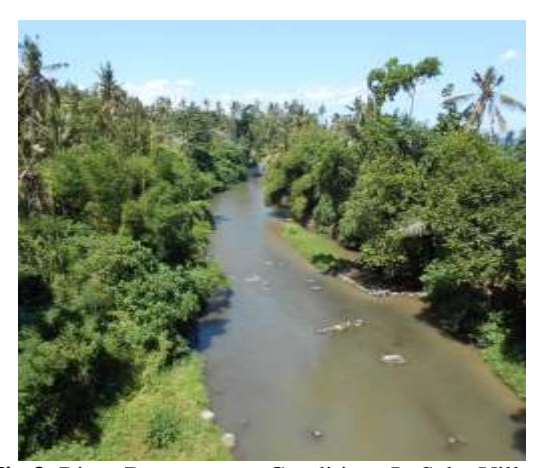
Fig 3. River Downstream Conditions In Saba Village

The raw water source from the river prior to use must meet the physical and chemical requirements. Transmission system from the surface water of a system that serves to deliver clean water from water sources (rivers / lakes) to the ground reservoir is then distributed to areas that require clean water. The way of water distribution depends on the location of the water source located downstream of Petanu River.