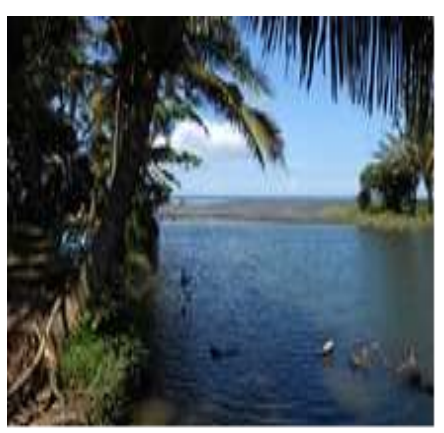
Fig 4. Estuary (Loloan)Petanu River

The society participation of Saba Village at this interactive level is the society directly involved in the implementation of the program. The village society of Saba has a duty in the activity. Participation for Incentives participation for Saba Villagers, at this incentive level is the community contributing labor and earning wages, in the process of facilitating facilities, cleaning and other activities such as, discussion activities involving all components of society.