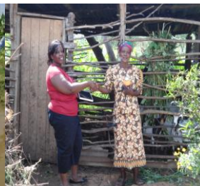
Goat keeping project

Ecotourism as an economic activity is being practiced, offering jobs to local residents.