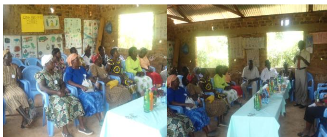
Local communities in a workshop

In order to protect and conserve the existing wetlands, trainings through workshops and seminars were conducted for local communities. This was done in collaboration with other stakeholders like Community Based Organizations, Non Governmental Organization's and line ministries such as Ministry Agriculture and that of Forestry. The trainings focused on application of different methods of land and water conservation practices. Principles of Integrated Approach in the wise use of wetland resources were emphasized.