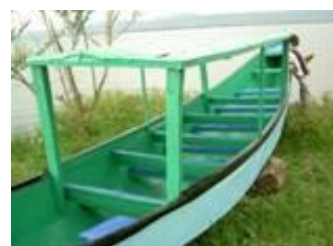
A completed boat for ecotourism