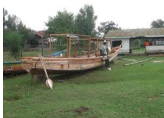
Boat under construction for ecotourism

Ecotourism as an economic activity is being practiced, offering jobs to local residents.