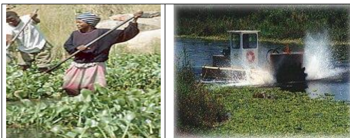
Figure .2 Mechanical methods

Physical method (Fig 2) is seen as the better treatment to the reproduction of the herbs. this method is used different types of tools to impress, collect, and deduct of "1500 hectares" of the plant in a "12-month" period of time.