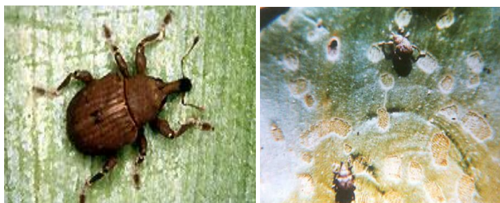
Figure (4) Sameodes albiguttalis

Researchers consideration the impacts of the biological method in inclusive host-domain studies and results that the insects is highly host-certain and will not confuse a impendence to any other plants other than Eichhornia crassipes . Researchers expect that the biological method will be more flexible than present biological methods to the chemicals that are perhaps in place to conflict the Eichhornia crassipes [19].