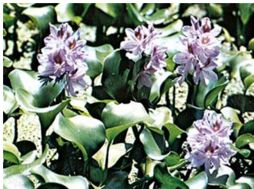
Figure .1 Eichhornia crassipes

Eichhornia crassipes is an free floating aquatic plant (Fig 1), known as water hyacinth and is often reflected a highly doubtful outside its municipal range.