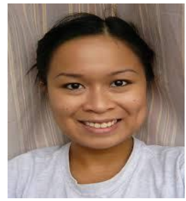
Fig 3.Orignal Image