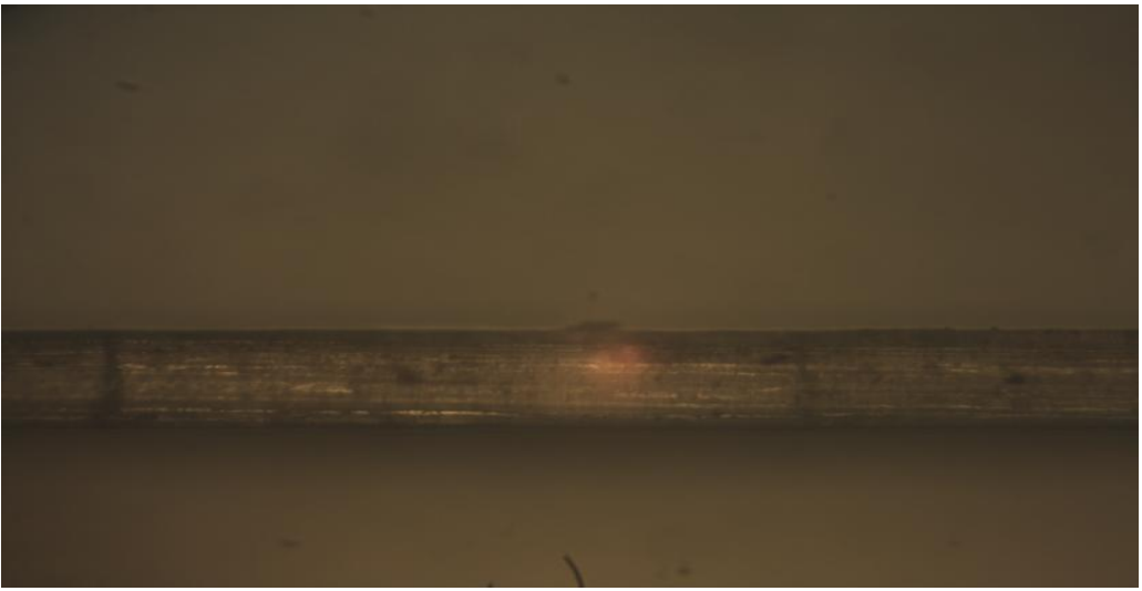
Figure 2: cross-sectional area retted banana fiber (x400) using Nikon Eclipse ME 600 microscope