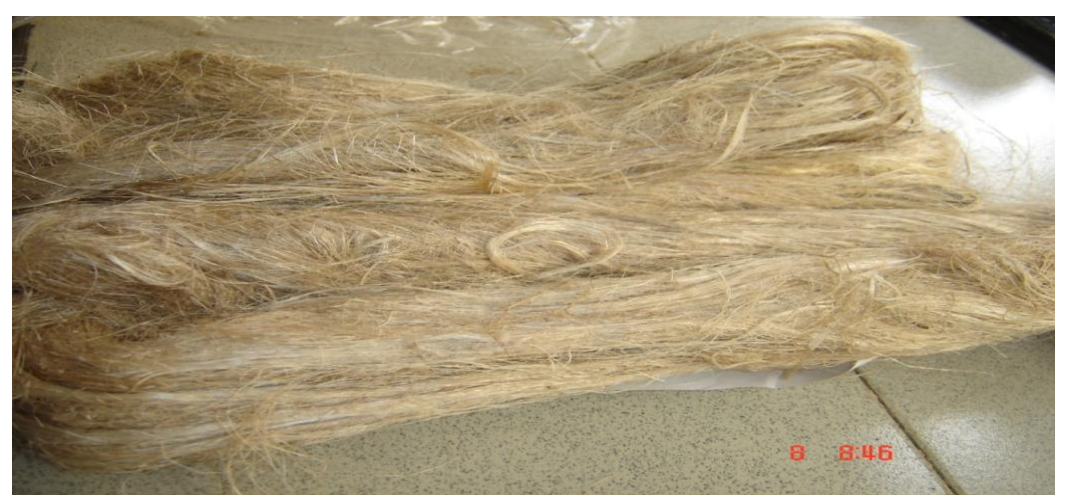
Figure 3: A photograph of banana fiber

A cross sectional area of strand of the fibers obtained (Fig 2) shows a white line which revealed the cellulose in the fiber while the dark spots and lines indicated points of microbial attack of the cellulose [10]. Figure 3 shows fibers that have been completely retted from banana trunk.