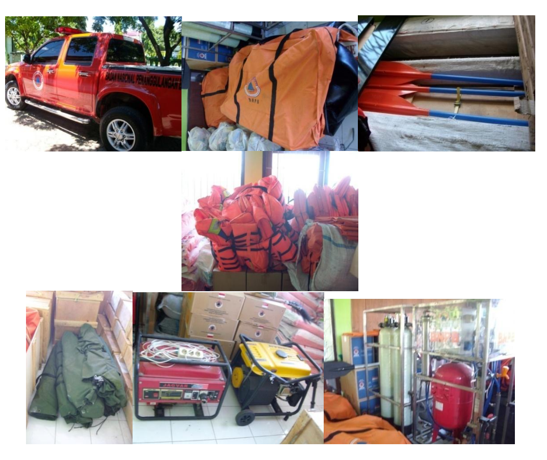
Figure 2. The Emergency Response Equipments of Flood in The Regional Disaster Management Agency of Ponorogo