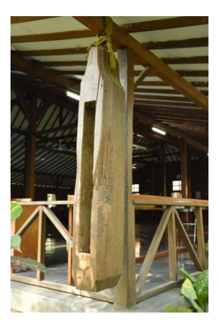
Figure 5. "Kentongan" The Traditional Tools of Emergency Response in Ponorogo

The community in Ngampel Village has a disaster preparedness to encounter if the flood is back. The behavior of mutual cooperation among the people are still strong enough so it is as its own power in order to minimize the risk of disasters. Early warning system when flood was coming carried by the villagers using "kentongan". "Kentongan" is a traditional tool to warning the people in that village when the emergency response of everything occurred in this village (Figure 5). "Kentongan" will be emitted when flood reached the highway, so the people can prepare to rescue themselves. The equipment used during the emergency response to evacuate the villagers who was trapped in flooded houses was use a simple equipment. It was rubber tires that serves as a float. Evacuation was done by the people themselves before the help comes from another institution. Evacuation of flood victims took a secure location. It was in Ponorogo-Pacitan highway, schools and mosques which were not flooded. At the time of the evacuation, people do not bring their items. The goods are left behind in the house, and after the flood recede, they would back to their house to saw their goods. This was done because the level of environmental safety at the time of flood in this village was still fairly well preserved.