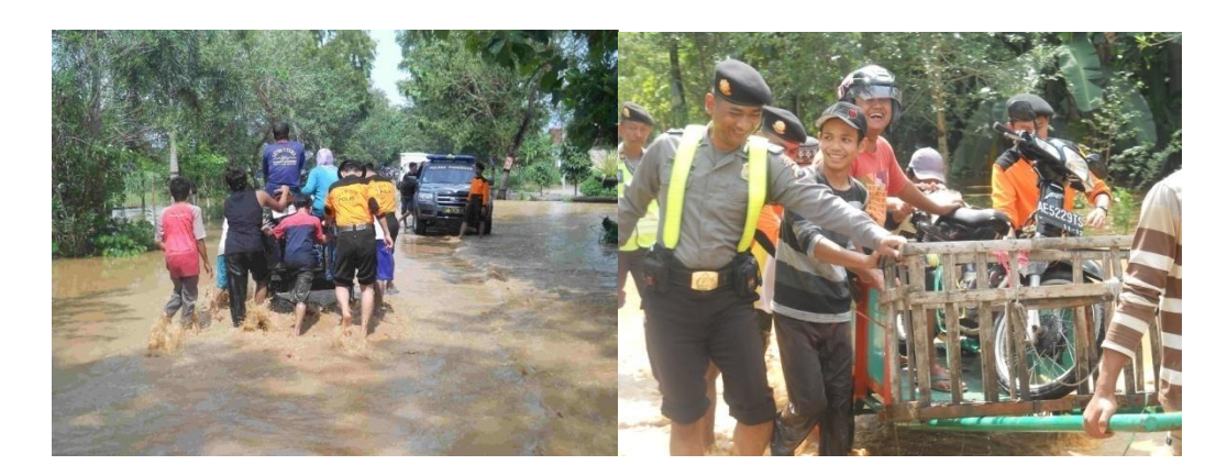
Figure 4. Evacuation Process Doing by Police on Flood Disaster in Ponorogo 2012 (Source: The Police of Ponorogo, 2012)

Besides the Police, Health Department also took to the disaster area when the flood occured. The roles of The Health Department include: the provision of health services to flood victims, providing logistical support to flood victims, to collect the data on the number of victims and the type of disease which infected the flood victims, also to perform the water treatment by giving chlorine to the contaminated wells caused of flood. Water that has been boiled with chlorine then could be consumed. Besides using chlorine, The Health Department also provides "Air Rahmat" or a powder that could be put into that polluted water so that the water could be consumed without cooking it first. However, the usage of "Air Rahmat" is rarely performed because the complexity of the procedures through to obtained "Air Rahmat", so giving chlorine is a step that could be done by the Health Department to provide the clean water supply for the flood victims. The diseases that often occur during the flood was not a serious illness.